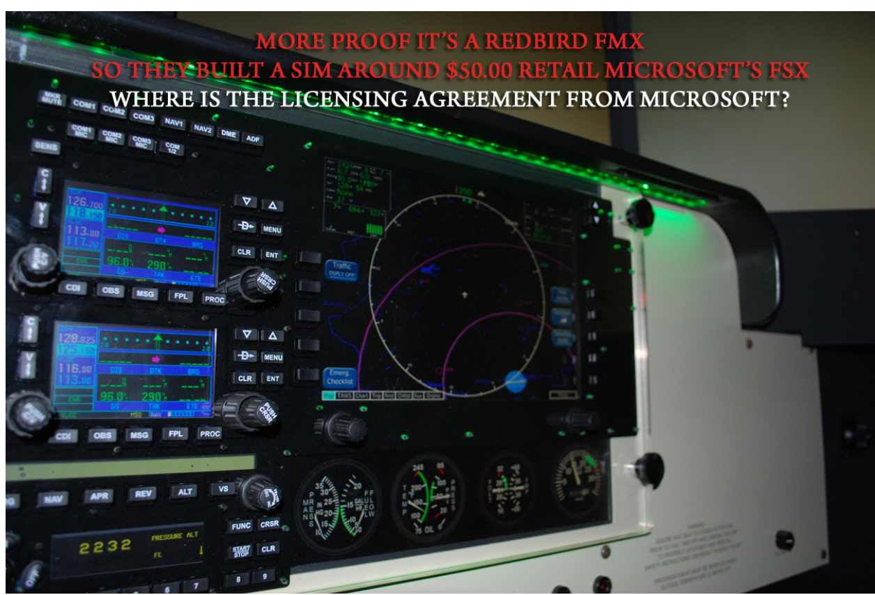
Since Microsoft does not authorize its use, the simulator is NOT APPROVED! PERIOD, END OF STORY! What about all that pilot logged time?